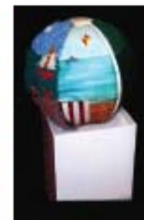
The Oak Workshop - Brighton Beach Ball