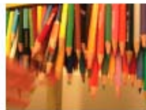
Monica Hughes - Drawing Table