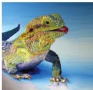
Carl Froth - Symbol L