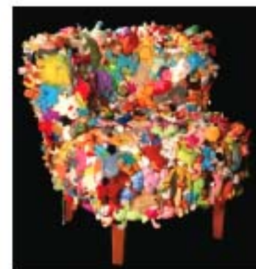
Kevin Hunt - Are you Selling Comfortably?