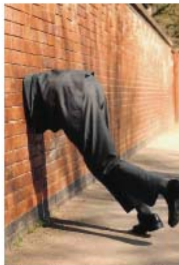
Victoria Clark - Escape From (Leaning Man)