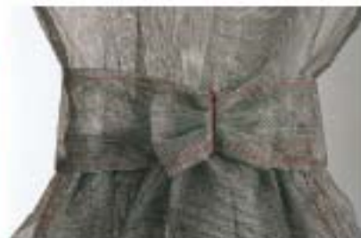
Ruth Schwabe - Childhood Revealed