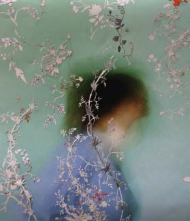
Lur Munoz & Noelia Yell - Fables